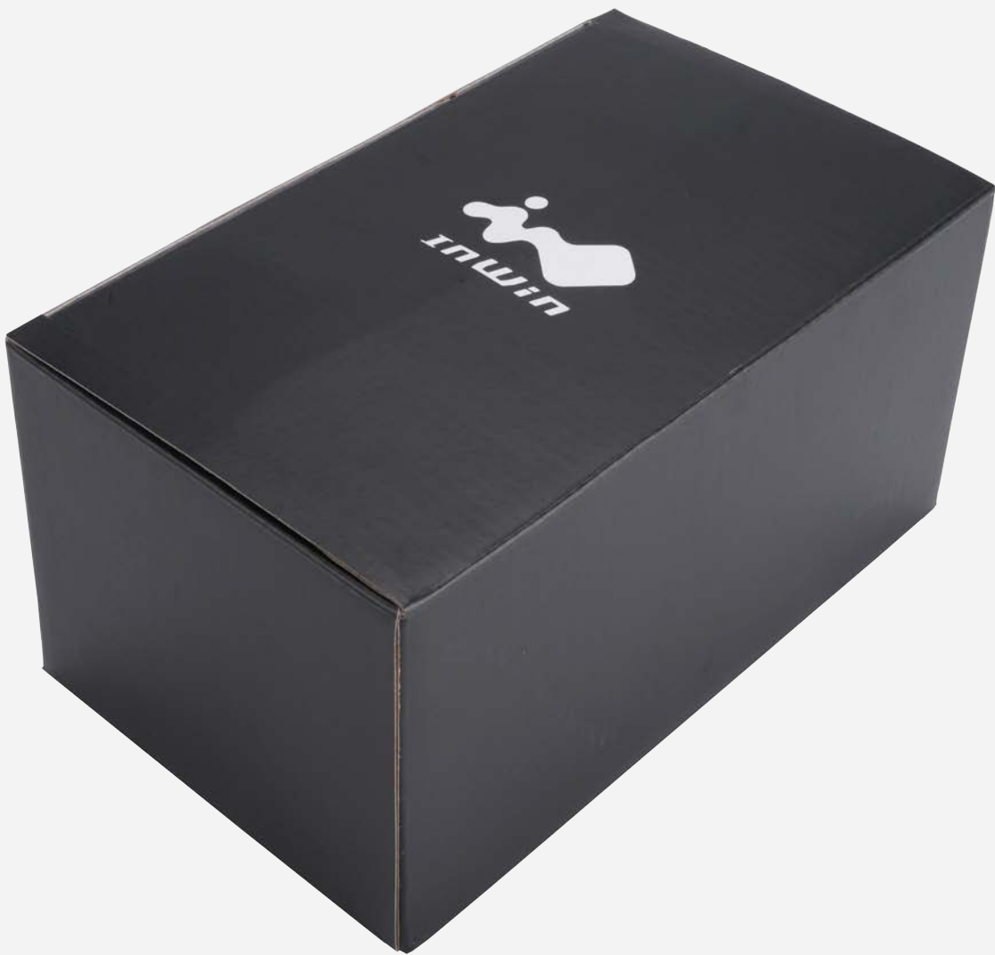
Modular Cables box