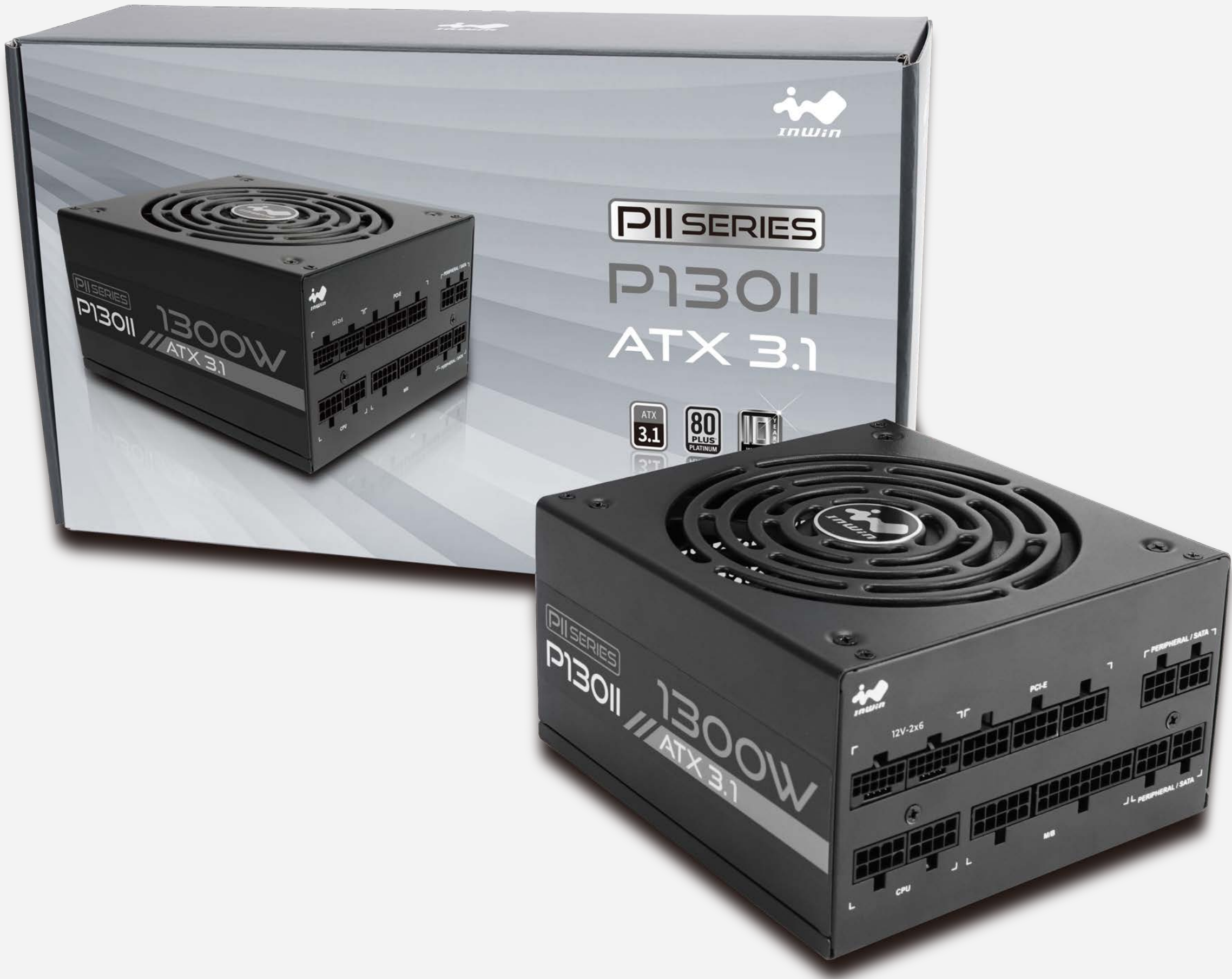
P|| Series Power Supply Unit x1 ( P105II/ P130II)